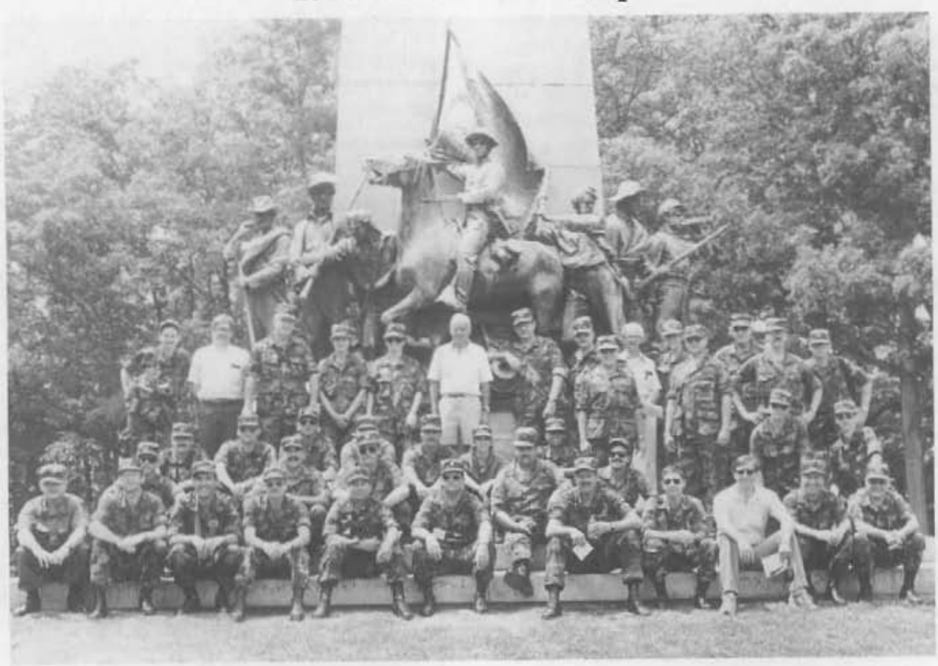
Participants in the Military History Detachment Workshop on a staff ride of Gettysburg Battlefield, Pennsylvania, July 1985.