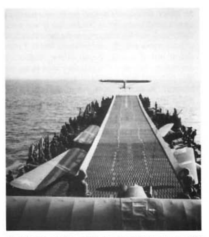
Liaison aircraft taking off from makeshift runway on an LST during Anzio landing (January 1944).

The use of LSTs as seaborne runways for organic Army airplanes led to the introduction of an apparatus instrumental in the recovery of aircraft flown off these vessels. Named after its inventor, Navy Lt. James Brodie, the Brodie Device was used during the battle of Okinawa in April 1945. It consisted of four masts extended over the water from the deck of an LST and was supported by a strong horizontal steel cable. A trolley with an attached sling underneath ran along the cable and, in turn, the sling caught a hook attached to a moving L-4 or L-5. If properly arrested by the sling the plane would stop immediately in mid-air and could then be lifted to the deck level of the LST and hoisted aboard. A specially reconfigured LST launched and retrieved a number of liaison planes off its deck during the Okinawa campaign without either loss of an