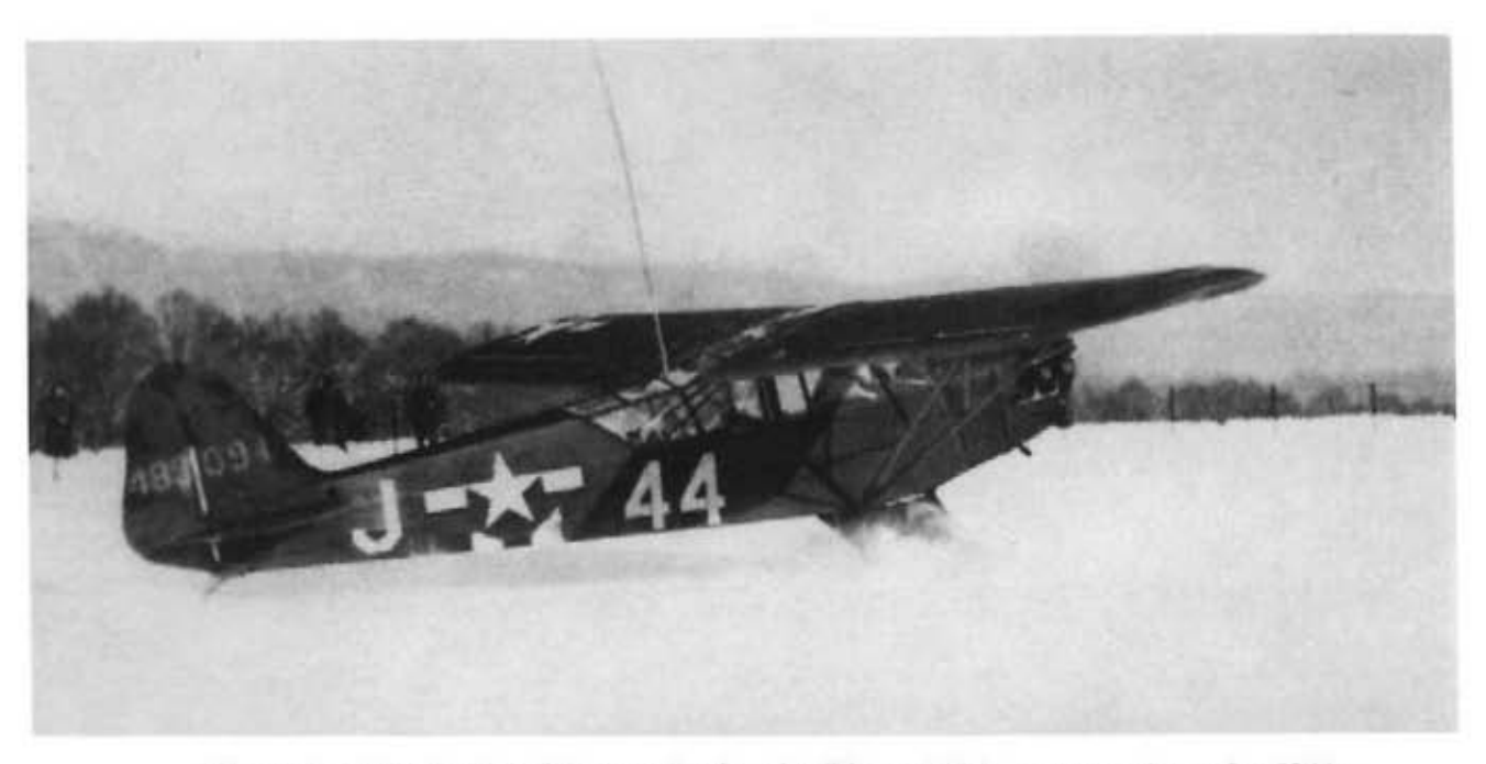
Observation aircraft, using skis, preparing for takeoff from a Belgium pasture (December 1944).

Air Forces the right to have its request for a larger role in the liaison aircraft mission reexamined in the event organic Army aviation was expanded, which it was in August 1945. Because of the surrender of Japan on 14 August, however, the War Department never did address the Air Forces' request when it came. (11)