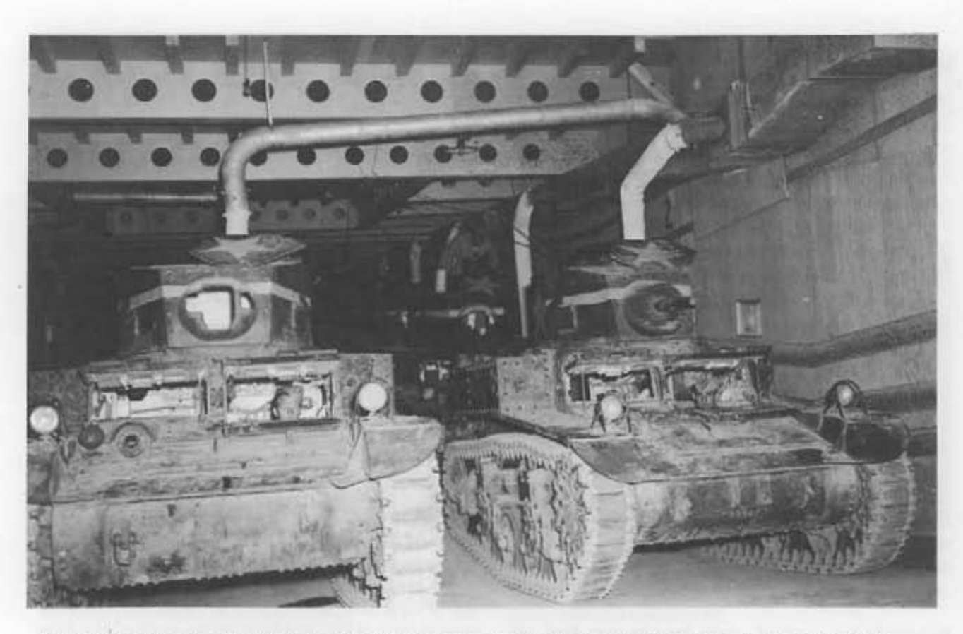
General view of mock-up bay with duct work and hose collectors installed for local exhaust test (above). View of bay from a point just above incline leading to bow opening, with thirty-nine light tanks in position (below).