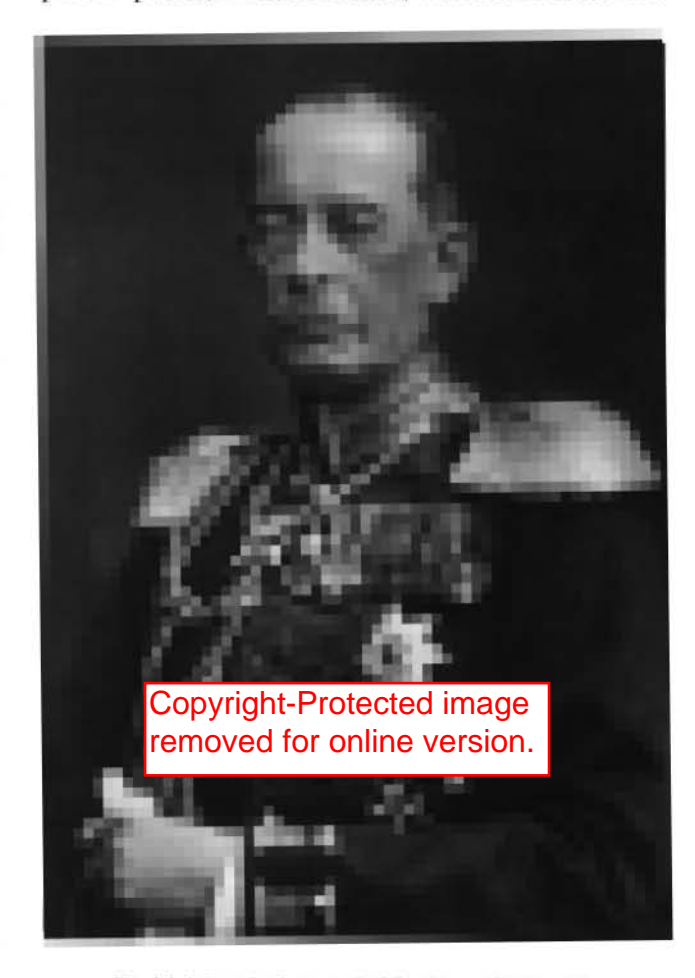
Field Marshal von Schlieffen

Schlieffen's series of Cannae essays, published in the German General Staff's Quarterly for Tactics and Military Science between 1909 and 1913 and later as a collected volume, has been wrongly viewed as the culmination of his military thought. These historical essays appear to demonstrate Schlieffen's preoccupation, if not obsession, with the doctrine of a