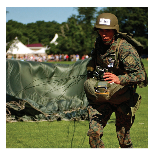
An Ecuadorian Paratrooper drags his parachute as he tries to beat the clock and get to his position after landing.

For the 10th year, Soldiers from the Kentucky National Guard's 20th Special Forces Group competed in the 25th Annual Leapfest, a one-day international military parachute competition, held Aug. 11 in Kingston, R.I.