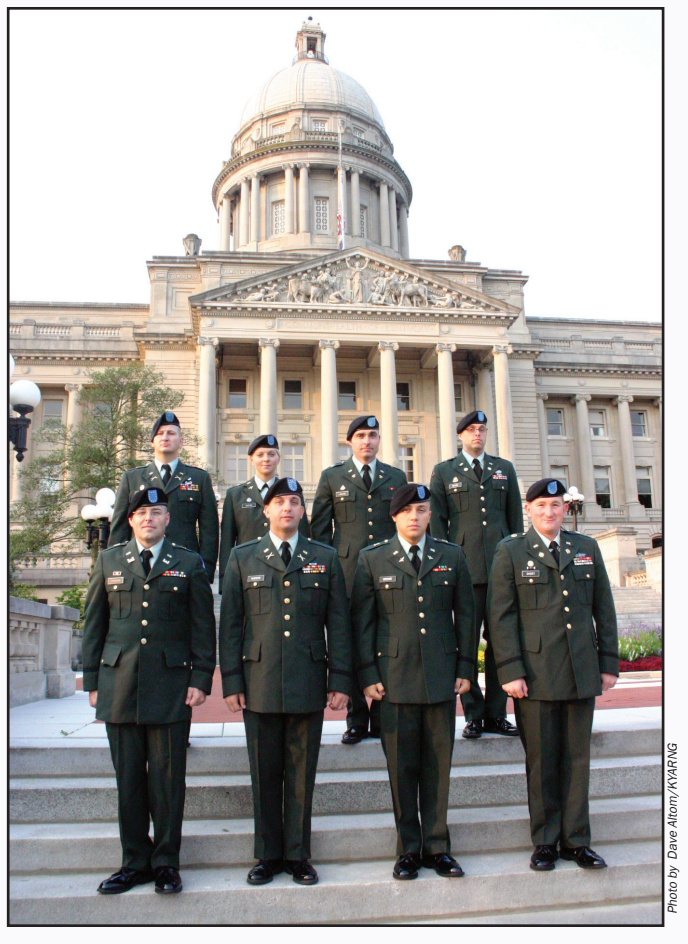
Lieutenants from the Kentucky National Guard Officer Candidate School Class 49-07 graduated at the Kentucky Capitol in Frankfort, on Aug. 18.

Both lieutenants leave for flight school in March.