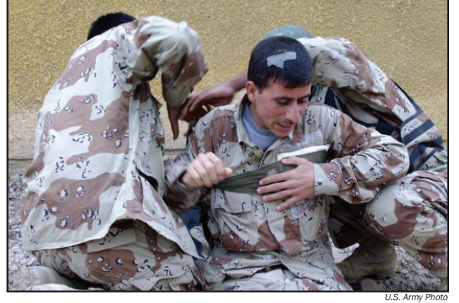
Newly recruited members of the only mechanized division in the Iraqi Army practice combat lifesaver skills.

"We are already injecting counterinsurgency strategies into First Army's realistic and demanding Theater Immersion training for our deploying Soldiers at Ft. Dix, N.J.," said Col.