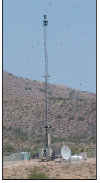
The Border Patrol has employed sophisticated technology, such as satellites, to assist agents with identifying illegal activities along the border.