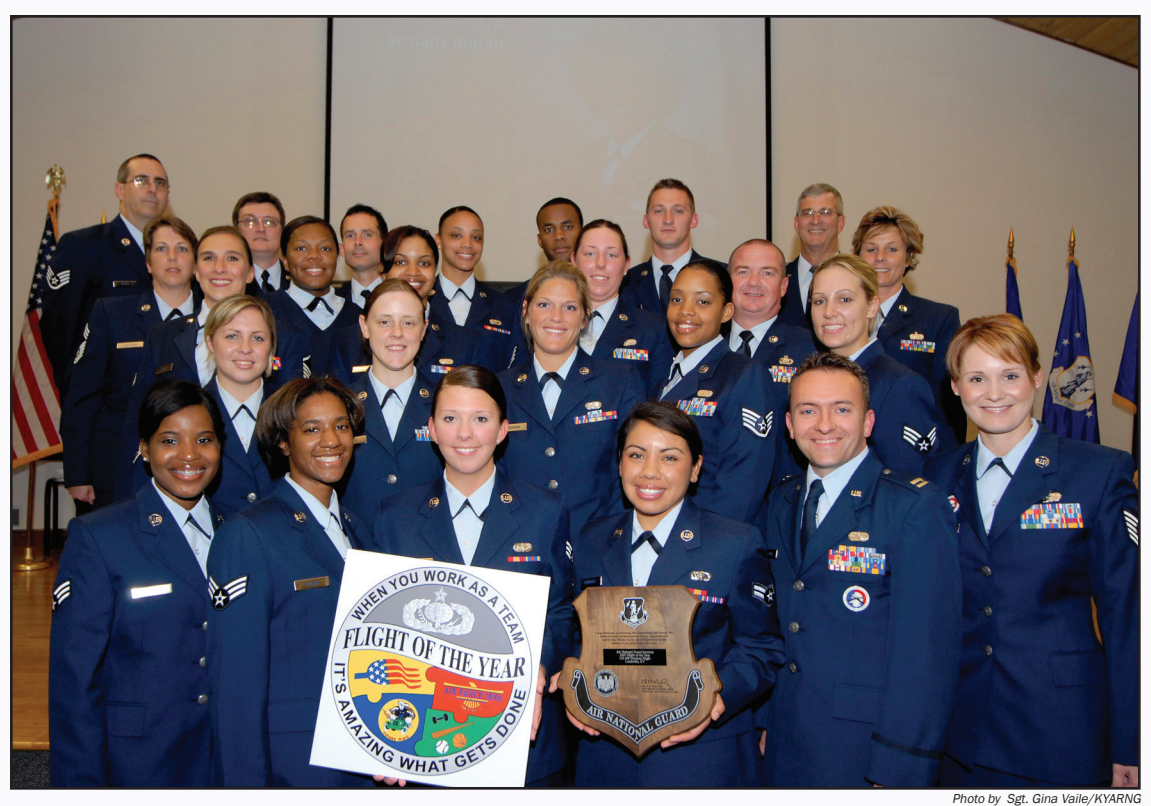
Members of the 123rd Services Flight display the Air National Guard's 2007 Services Flight of the Year award during a ceremony held June 10 at the Louisville Air Guard Base. The Services Flight has participated in humanitarian relief missions around the United States, including responding to flooding and hurricane relief

That role expands during deployments to include the operation of mobile field kitchens and other support activities.