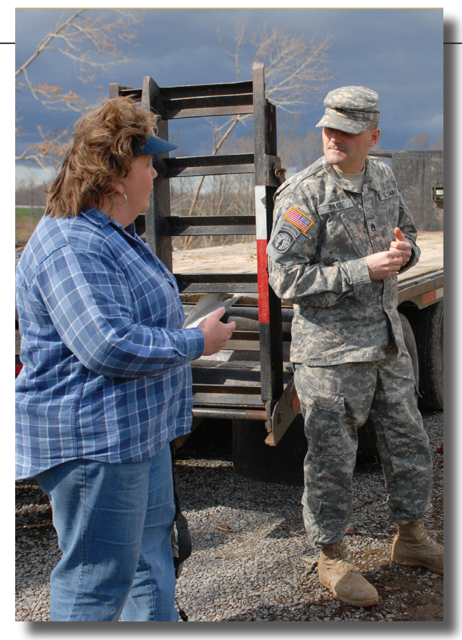
Tornadoes ripped through Western Kentucky February 5, causing severe damage to the town of Powderly, Ky. National Guard troops responded to the area.