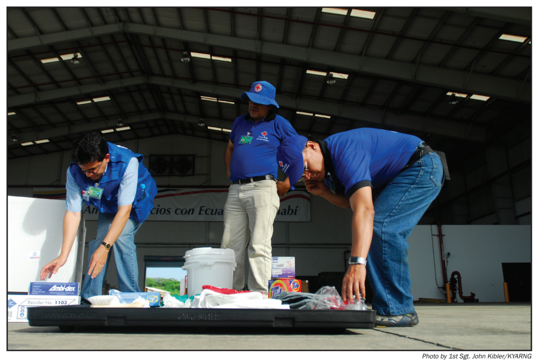
Members of the Ecuador Red Cross separate supplies from pallets delievered by Kentucky Air National Guardsmen March 5. The Kentucky Guard airlifted 162 flood clean-up kits and related equipment after the area was devastated by flooding.

The aircraft left Louisville on March 5, arriving at Dobbins Air Reserve Base, Ga., to pick up the supplies. On Thursday, the aircraft flew under the operational direction of U.S. Southern Command to Manta. Ecuador. carrying 162 flood clean-up kits and related equipment. The supplies will be provided to local disaster relief officials