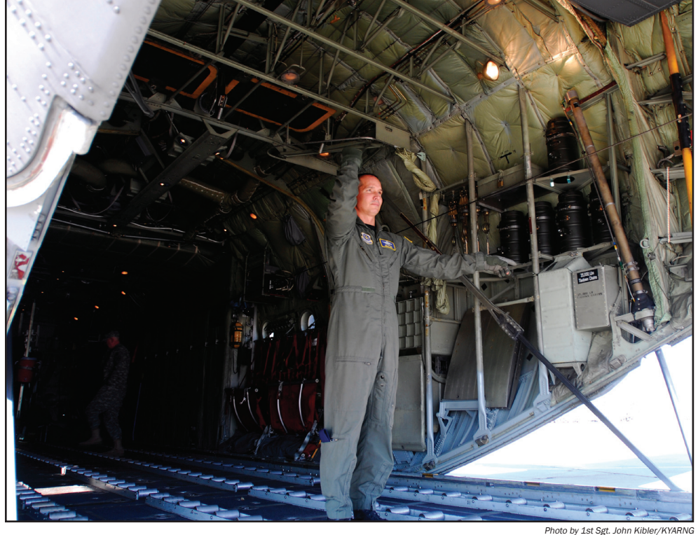
A Kentucky Airman prepares a C-130 Hercules to accept a pallet of supplies for the Ecuador flood relief mission March 5.

He added that this effort would not have been possible without the Centers for Disease Control's donation of supplies from their stockpiles and the airlift of the supplies to Ecuador by the Kentucky