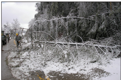
Kentucky Army National Guard engineers cut branches from fallen trees during the December 2009 storm that blanketed much of Eastern Kentucky with up to 10 inches snow.

During the 4 day mission, the engineers cleared roughly 120 miles of roadway laden with fallen trees and transported more than 2,500 gallons of drinking water to relief centers all throughout Southeast Kentucky.