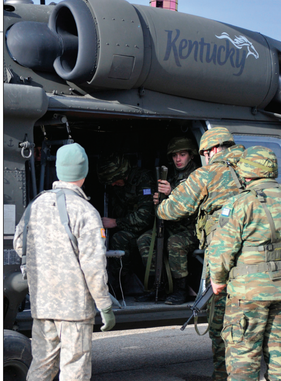
Greek soldiers board a Kentucky National Guard UH-60 Blackhawk helicopter during a training exercise at Camp Rigas Fereos in Kosovo.