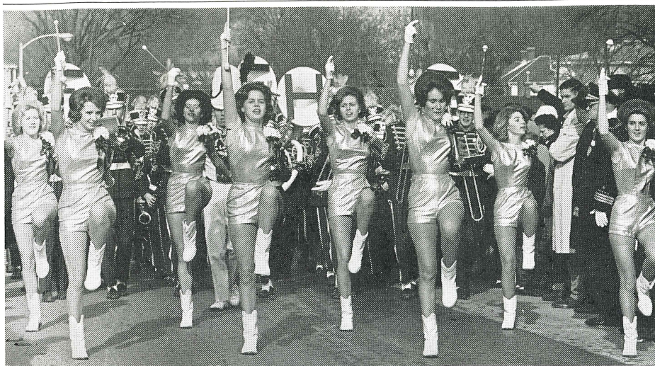
—133d PID Photo

ON REVIEW —Eight pretty majorettes from the Frankfort County High School prance by the inaugural stand.