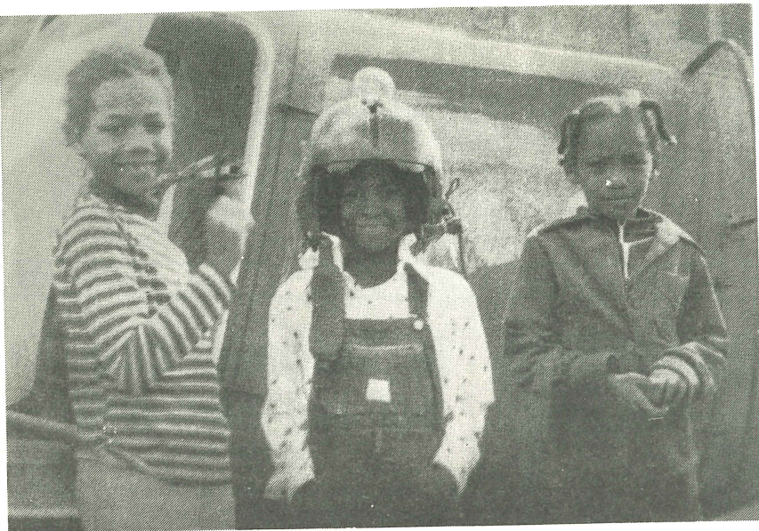
SMILE —Three students from Coral Ridge Elementary School pose in front of an Army Guard helicopter while Guardsmen visited the school. Guard officials visited several schools and made flag presentations during the activation.