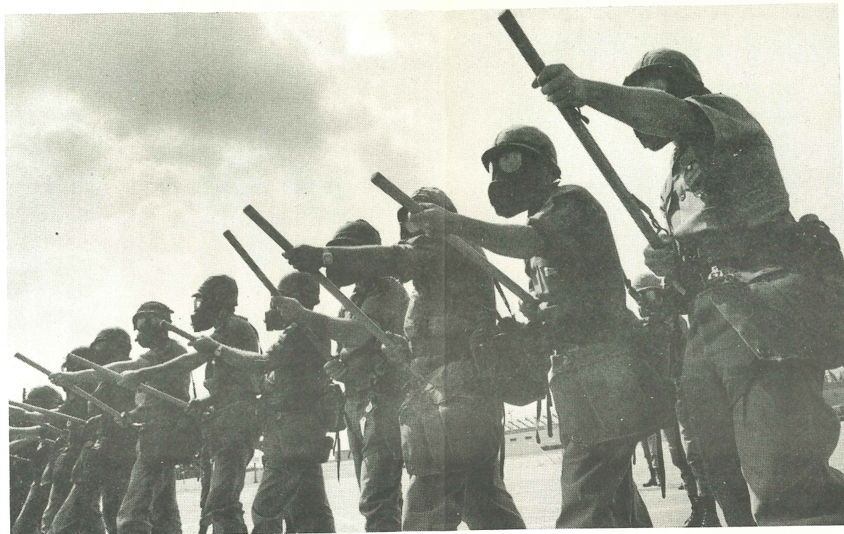
PRACTICE —Members of the 2nd Bn., 138th FA practice crowd control techniques before deployment to potential trouble sites.