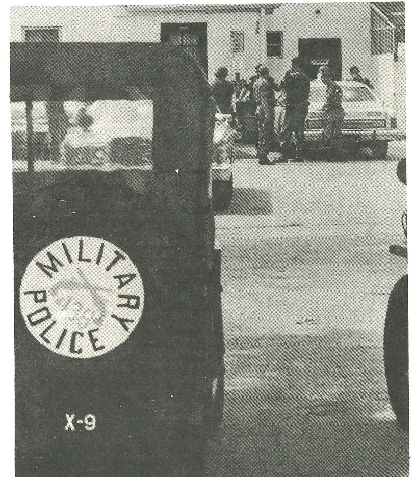
STAND BY —Military Policemen stand by at the State Fairgrounds and Exposition Center, conferring with the Kentucky State Police.