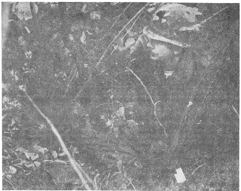
COMMO CHECK --An unidentified member of the 1st Bn., 623d FA checks the communications system during "Operation Redleaf." More than 1,000 artillery troops were involved in the Fort Knox exercise.

It was the second major exercise of its type during the year.