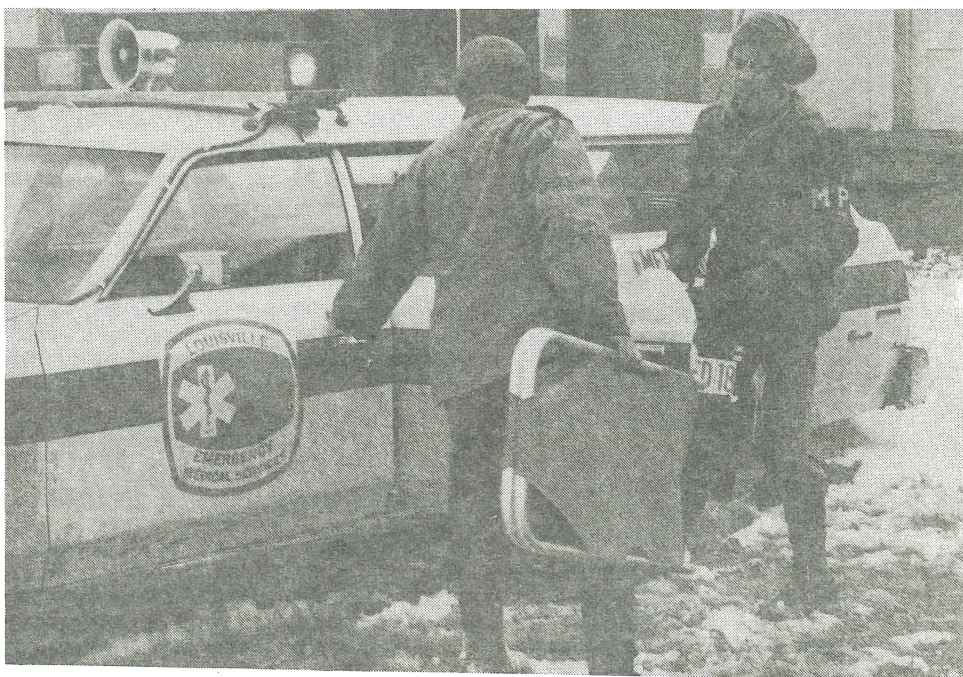
National Guard MPs assist the Emergency Medical Services Center in Louisville. Guard vehicles brought out patients where ambulances could not travel because of the snow and ice. Similar activity occurred across the state.

Commonwealth. Almost all units were providing several types of emergency assistance until Feb. 3. A total of 2,675 (see "Snow Assist" on page 3)