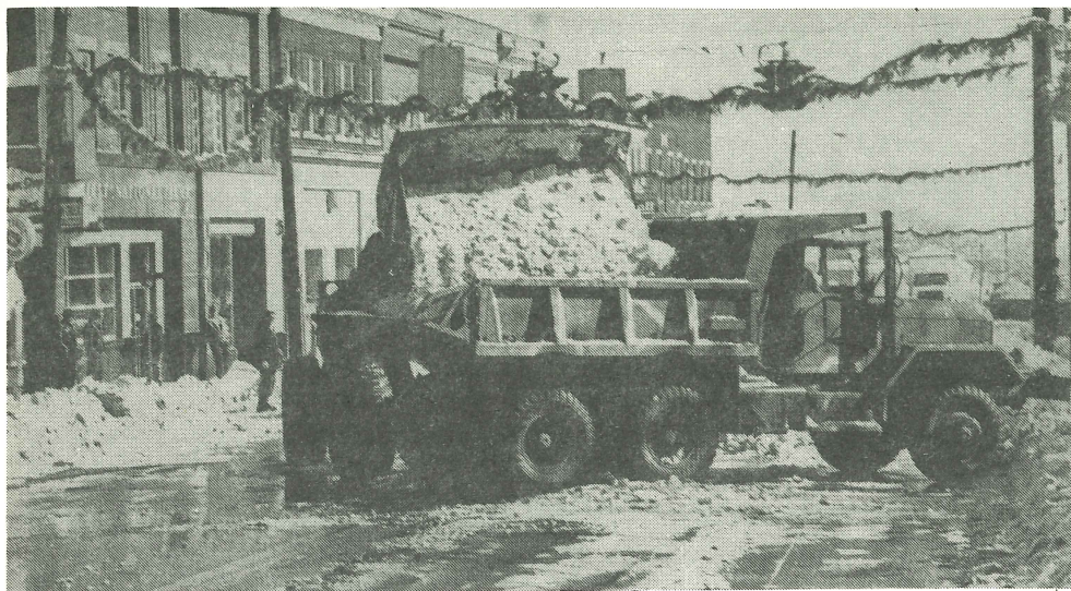
Guardsmen clean city streets in Grayson so normal activity can be resumed. Later they would aid the community by providing water services after a train derailment near Leon contaminated the water system.