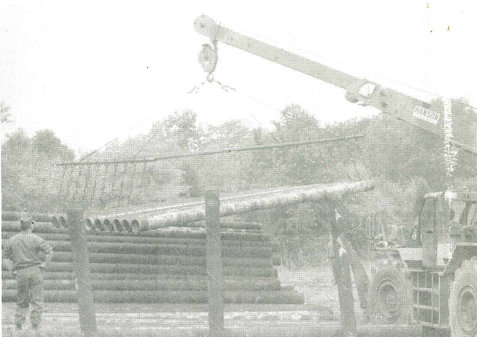
TROOPS FROM THE 201st Engineer Battalion in Ashland and Cynthiana loaded and transported pumps and pipes needed to avert a serious water shortage in three Kentucky communities.

The personnel section of state headquarters has been under pressure for the past few weeks cutting the hundreds of orders for assignments to the new brigade.