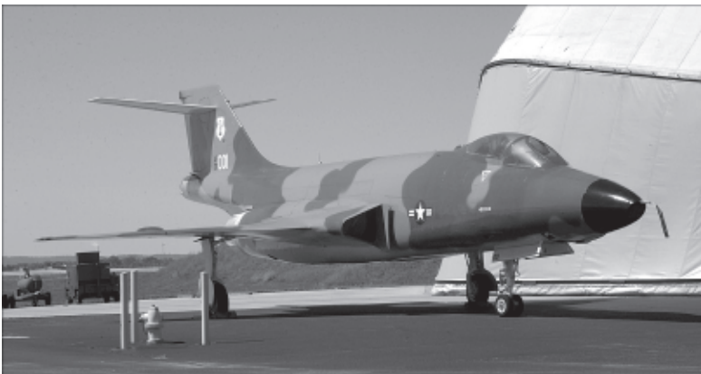
The Kentucky Air Guard flew the RF-101 Voodoo aircraft from 1965 until 1976, when the unit converted to the RF-4C. Both airframes were designed for aerial reconnaissance missions.

The RF-4C Phantom II was the last supersonic aircraft to be flown by the Kentucky Air Guard. It was retired in 1989 and replaced with C-130s as the wing's mission shifted to airlift.