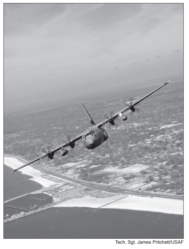
USAF Hurricane Hunters track a subtropical storm off the coast of Georgia in a WC-130J aircraft.

Two Hurricane Hunter aircraft will be equipped with the radiometers by the end of June with one added each month until all of the 403rd Wing's 10 WC-130J aircraft are outfitted with the SFMR pod.