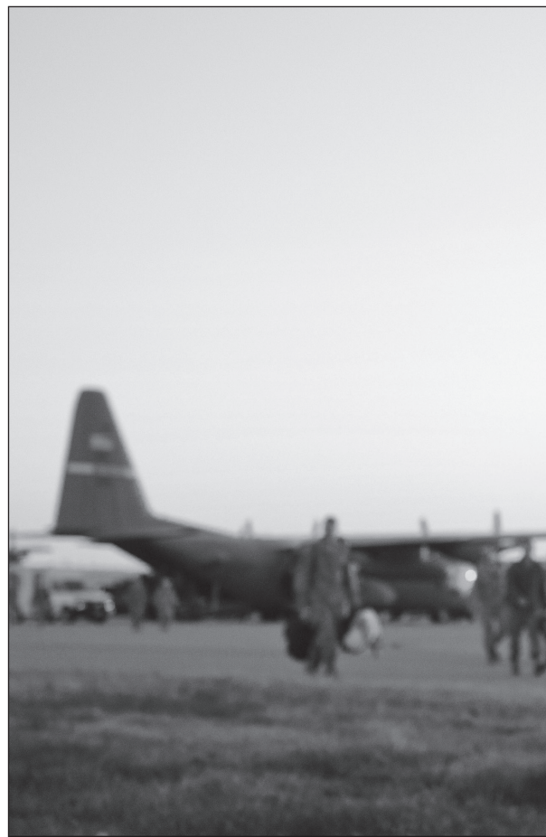
Above: A member of the 123rd Airlift Wing gets a welcome

Additional photos are available at www.flickr.com/photos/kyngpao/sets/72157631978010484/