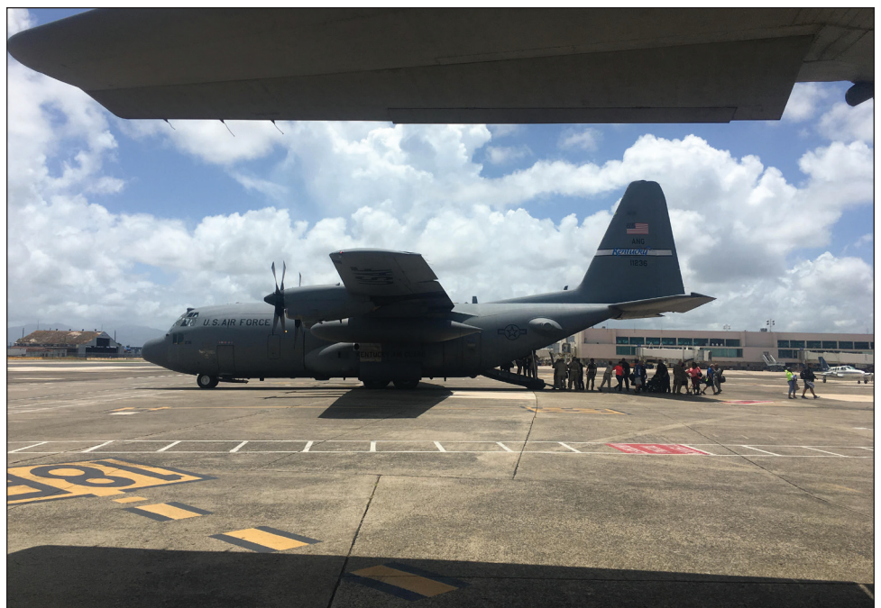
Kentucky Air National Guard

"We all take a lot of pride in what we do, and we deeply appreciate the opportunity that we get to be involved in something like this," he said.